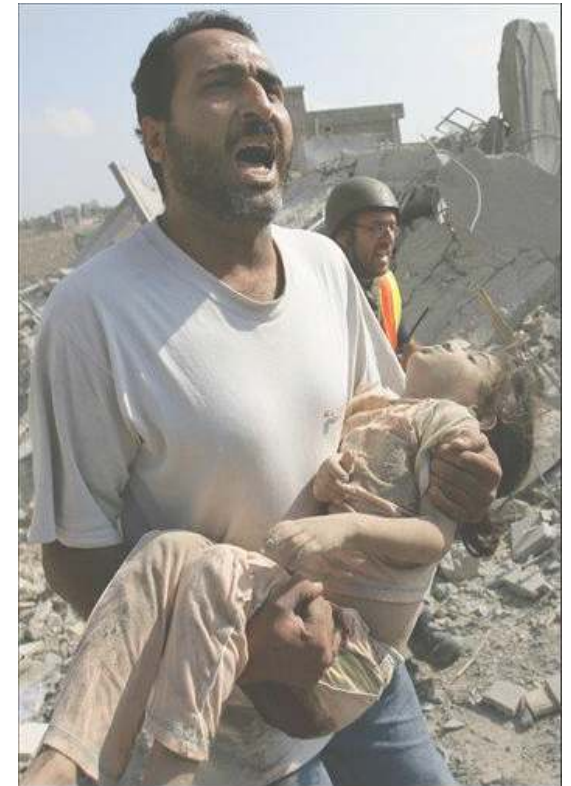
Child injured in Israeli attack on the Gaza Strip